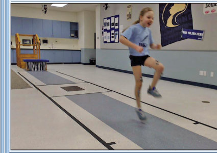
Skipping SEMG for Child with Left Hemiplegia