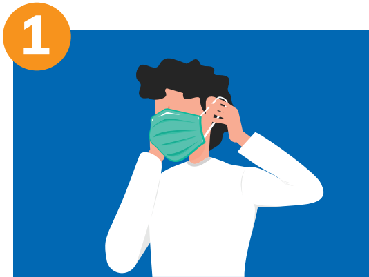
1 Loop the mask around your ears.

If you have been asked to wear a mask, please keep it on for the entire visit.