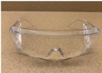
Over Ear Eye Protection: