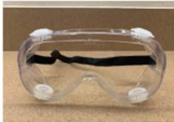
Goggles with head strap: